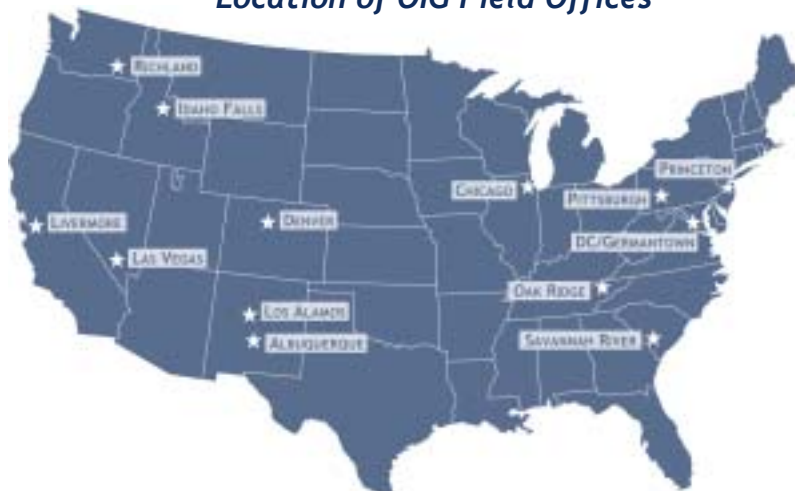
Location of OIG Field Offices

In addition to the Washington, D.C. area, OIG offices are located at key Department sites around the Nation.